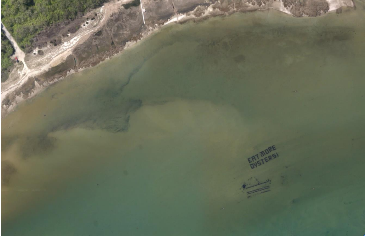
Oyster farm west of Barnstable Harbor, MA